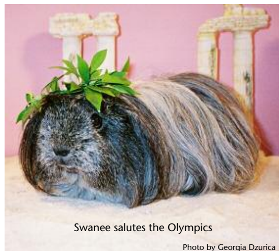
Swanee salutes the Olympics