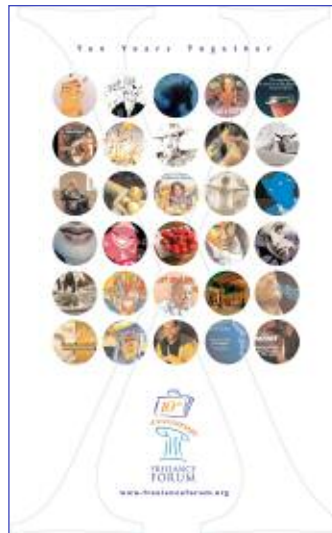
Your work could appear on this fabulous cover!